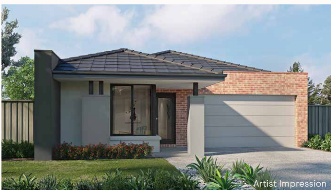
Lot 1810 • Cremorne 16 Portsea