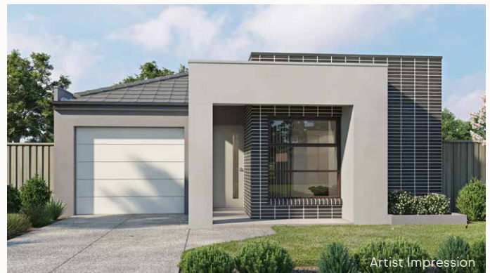
Lot 1809 • Capeside Hayworth Custom