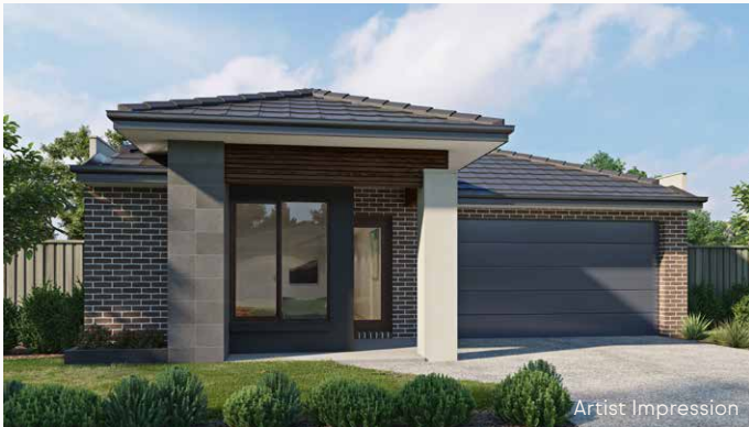
Lot 1806 • Cremorne 16 Belmont