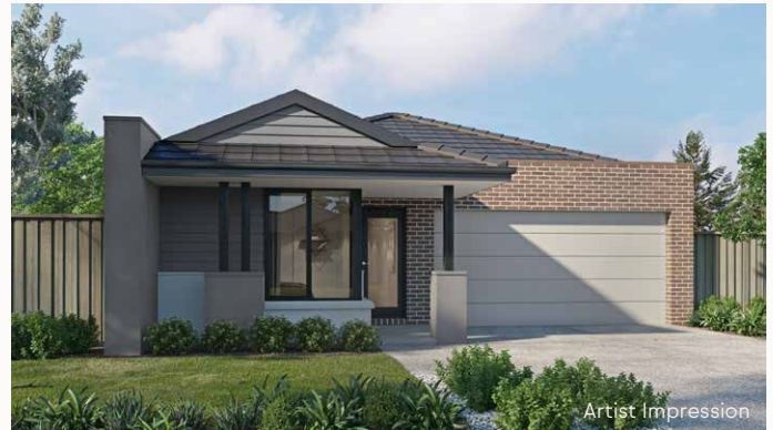
Lot 1807 • Cremorne 16 Hampton