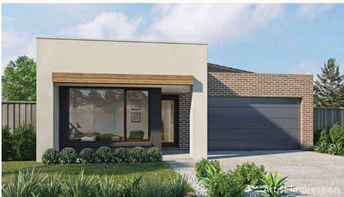
Lot 1808 • Capeside Apollo