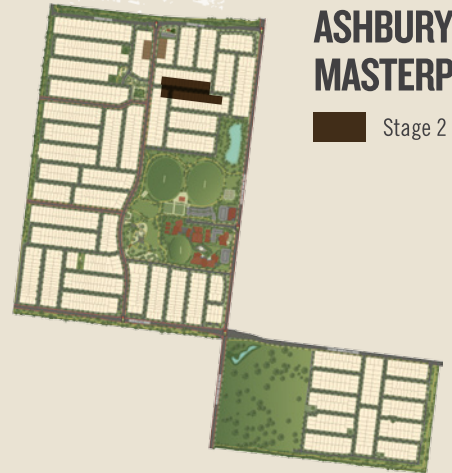
ASHBURY MASTERPLAN Stage 2

Perfectly positioned close to the main entrance from Boundary Road, The Northern Reserve and the wide, tree-lined boulevard that runs the course of Ashbury estate, the Stage 2 release is second to none. Situated in a quiet pocket of the estate, these generous sites are ready and waiting for your dream home.