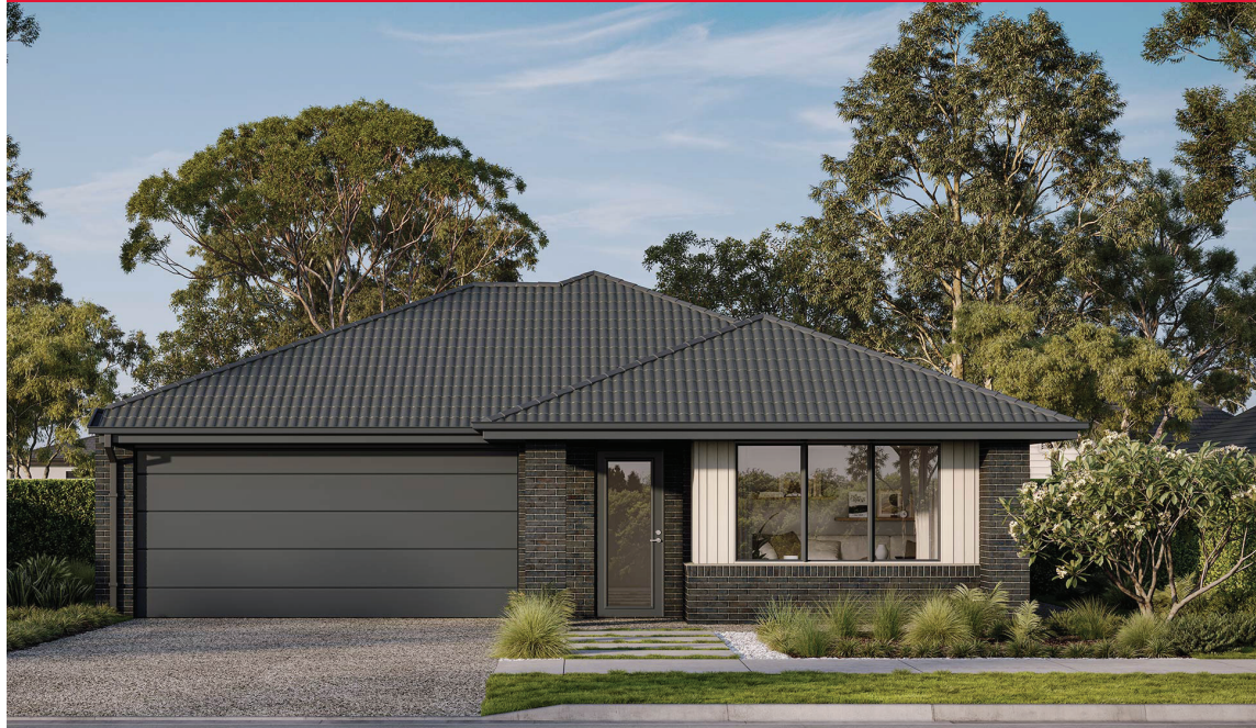
MUNDI 24 | EMERGE RANGE