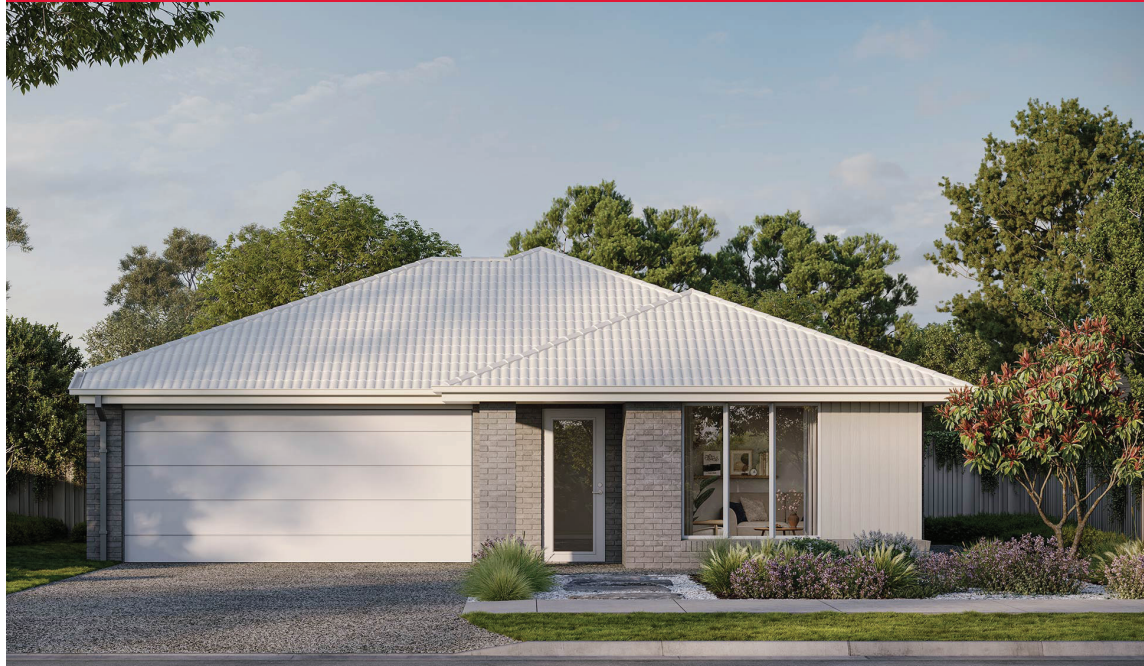
KIAMA 18 | EMERGE RANGE