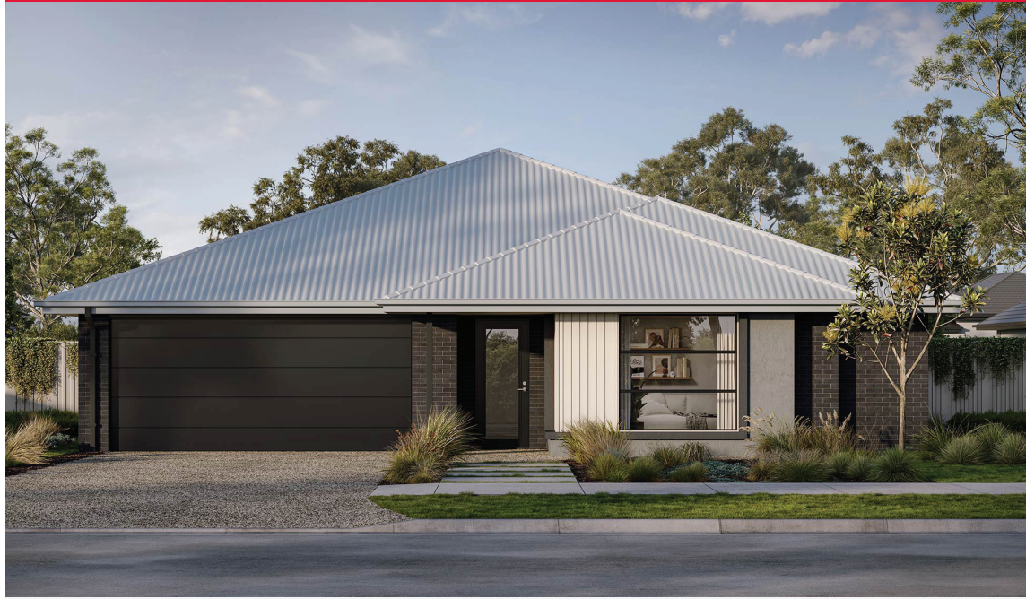
FAIRLIGHT 22 | EMERGE RANGE